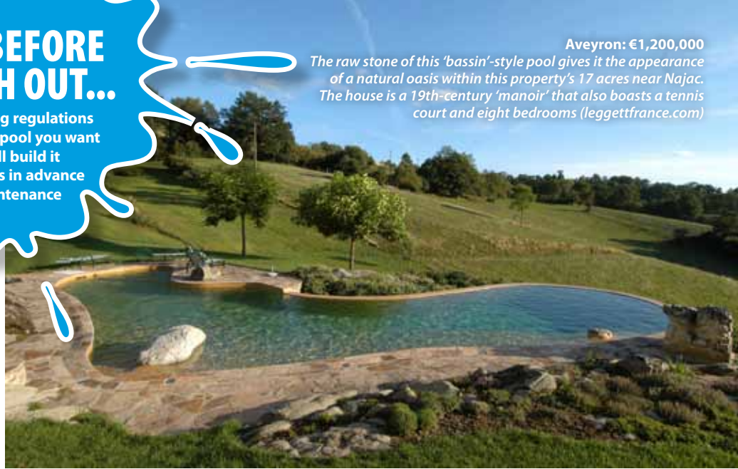
Aveyron: €1,200,000 The raw stone of this 'bassin'-style pool gives it the appearance of a natural oasis within this property's 17 acres near Najac. The house is a 19th-century 'manoir' that also boasts a tennis court and eight bedrooms (leggettfrance.com)