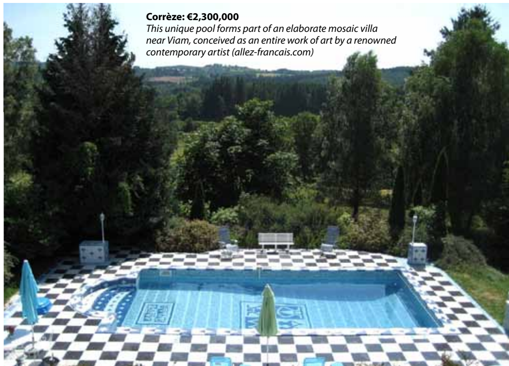
Corrèze: €2,300,000 This unique pool forms part of an elaborate mosaic villa near Viam, conceived as an entire work of art by a renowned contemporary artist

Short of having a bespoke pool designed and installed while you pop off to Monaco for the weekend, there are other affordable ways of making a splash